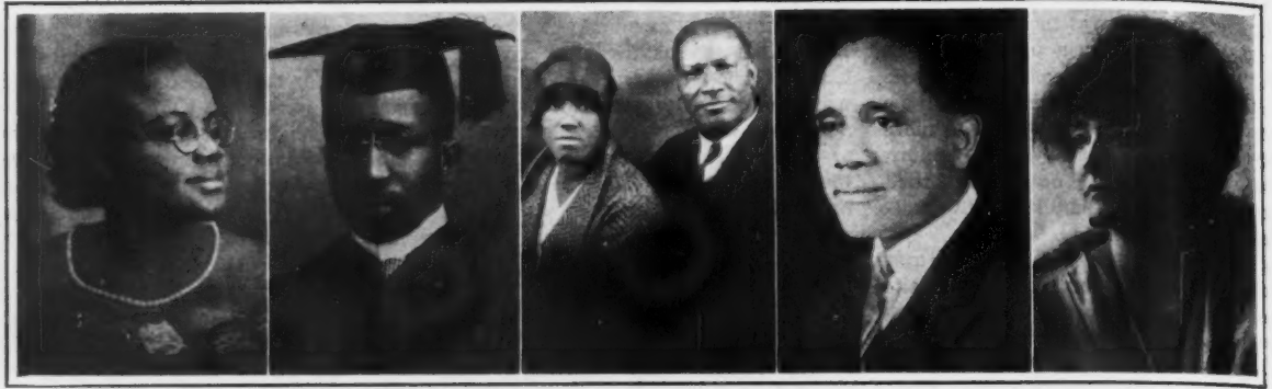
Miss Fisher page 166